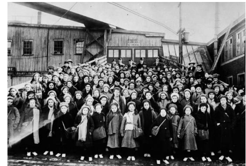
Home children, St. John, NB. c.a. 1920

Checkout BIFHSGO's best-known website collection—its extensive indexes of home children records, including records from Dr. Barnardo's, Middlemore, immigration records prior to 1892, Fegan Homes and photos from St. George's Home in Ottawa.